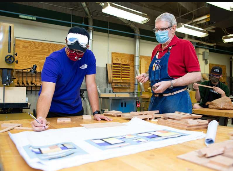
Woodshop + CNC Machines

INNOVATIVE CREATIVITY: USING EXISTING KSU FACILITIES - OPTIMIZATION