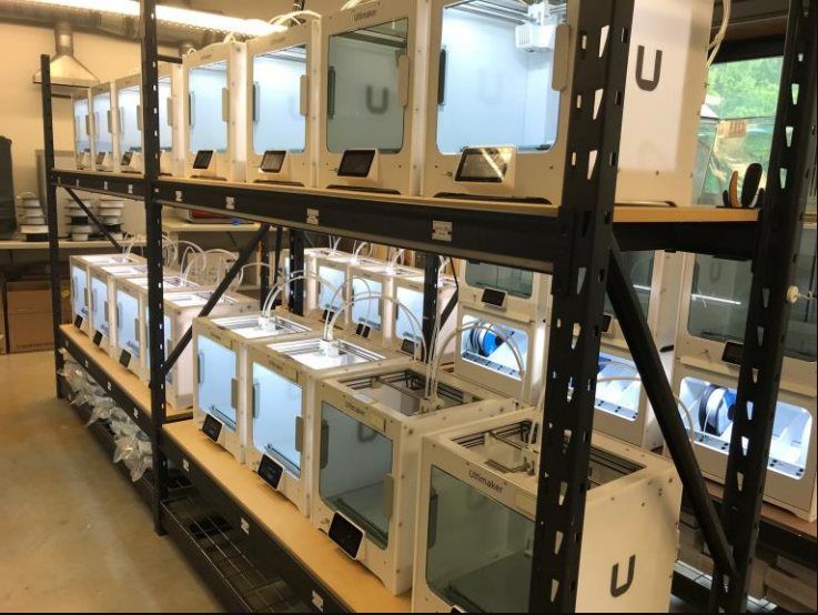
Digital Fabrication Lab, CACM