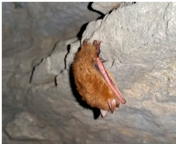
A tri-colored bat hibernates on a ledge.