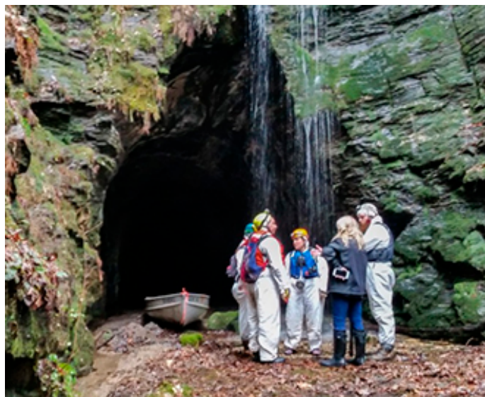
Researchers and wildlife managers talk with a landowner at Black Diamond Tunnel in Georgia.